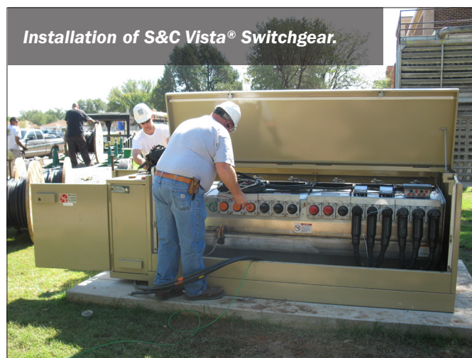
Installation of S&C Vista® Switchgear.

ENMU approached TME, Inc., an Arizona engineering services company, to consult with the university on what would be the best solution. Knowing the university wanted the highest level of power reliability, TME, Inc. collaborated with S&C Electric Company to engineer a state-of-the-art S&C High-Speed Fault-Clearing System at the Portales campus. The High-Speed Fault-Clearing System features S&C Remote Supervisory Vista® Underground Distribution Switchgear units that have been specially equipped with multifunction, microprocessor-based relays. These relays communicate with each other through a high-speed fiber-optic cable network. The High-Speed Fault-Clearing System is a closed-loop system that can isolate a main feeder fault in less than six cycles . . . or 0.1 seconds. If needed, the electrical distribution